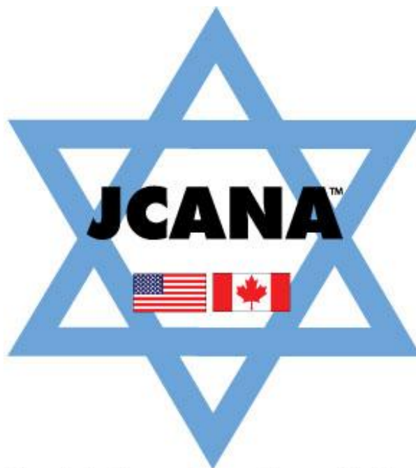
Jewish Cemetery Association of North America

Skokie, IL June 12-14, 2011 10-12 Sivan 5771